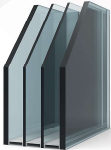
4 glasses, safety glass inside and outside 33.1+4+4+33.1