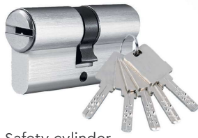
Safety cylinder EX-200