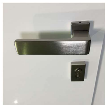
Inside Handle ID-35 EX-502